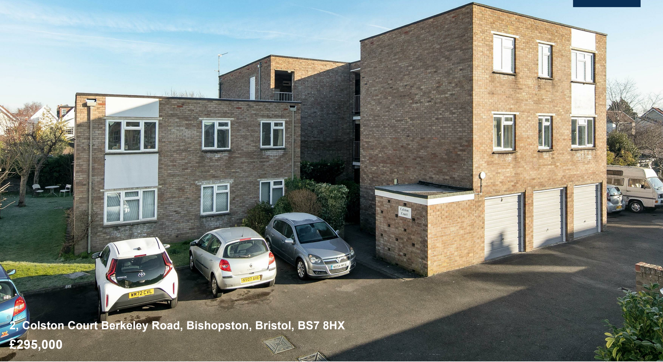
2, Colston Court Berkeley Road, Bishopston, Bristol, BS7 8HX